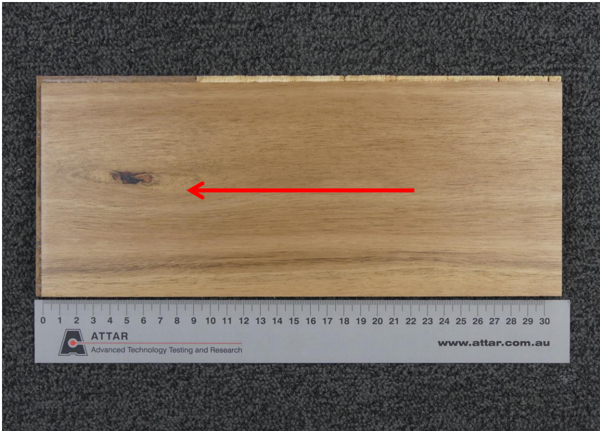
Figure 1: Unilin EWF Light Brushed Matt Finish AWS Arrow indicates direction of testing